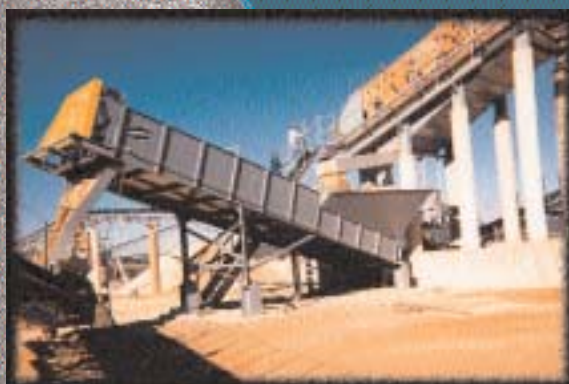
Fine Material Dewatering Screws