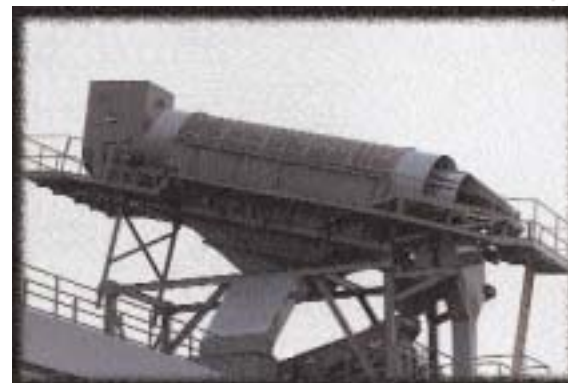
Rotary & Vibrating Screens