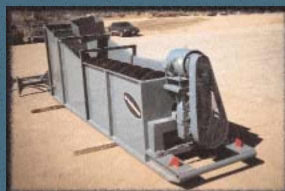
Coarse Material Washers