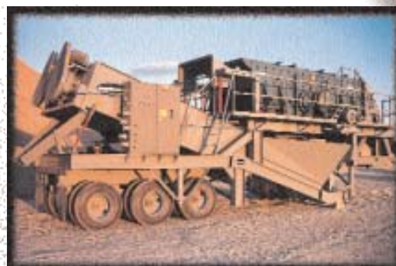
Portable Wash/Screen Plants