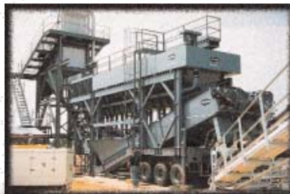
Portable Sand Plants