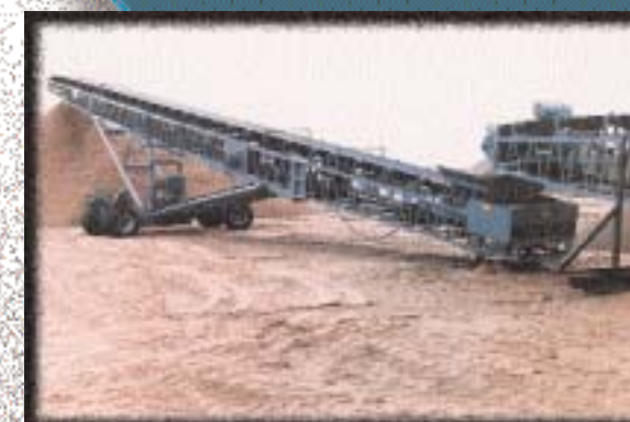
Portable Conveyors & Radial Stackers

Also Available: Portable Screening Plants • Twin Jets • Cutter Heads